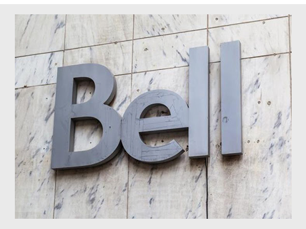
Unifor condemns Bell Canada executives for awarding themselves more than $5 million in bonuses during massive job cuts.